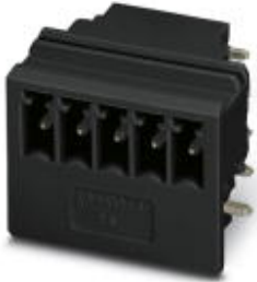
PCB terminal block

Please be informed that the data shown in this PDF Document is generated from our Online Catalog. Please find the complete data in the user's documentation. Our General Terms of Use for Downloads are valid ( http://phoenixcontact.com/download )