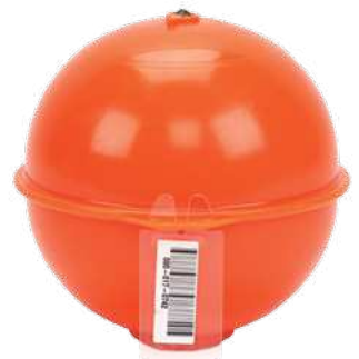
3M™ EMS Ball Marker Self leveling feature, suited for depths of 5–6'