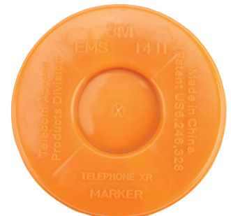
3M™ EMS Disk Marker Ideal for marking at shallow depths of 3–5'