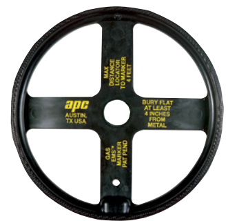
3M™ EMS Mini-Marker Designed for maintaining a stable position after placement at depths of 6'