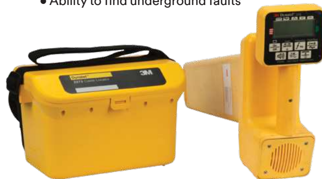
3M™ Dynatel™ Locator Features by Model