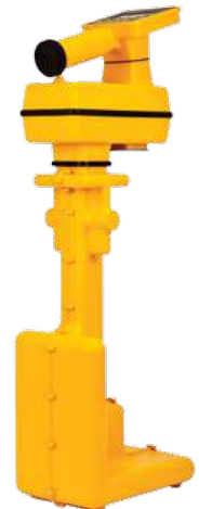
3M™ Dynatel™ iD Marker/EMS Tape Locator 7420