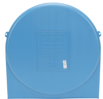
3M™ EMS Full Range Marker Suited for deep applications of up to 8–9'