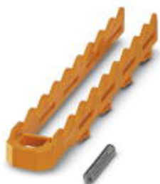
Component housing, length: 99 mm, Lock and Release system, color: orange, width: 16.2 mm

Please be informed that the data shown in this PDF Document is generated from our Online Catalog. Please find the complete data in the user's documentation. Our General Terms of Use for Downloads are valid ( http://phoenixcontact.com/download )