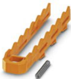
Component housing, length: 77 mm, Lock and Release system, color: orange, width: 16.2 mm

Please be informed that the data shown in this PDF Document is generated from our Online Catalog. Please find the complete data in the user's documentation. Our General Terms of Use for Downloads are valid ( http://phoenixcontact.com/download )