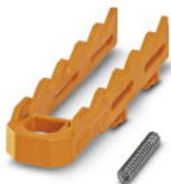
Component housing, length: 55 mm, Lock and Release system, color: orange, width: 16.2 mm

Please be informed that the data shown in this PDF Document is generated from our Online Catalog. Please find the complete data in the user's documentation. Our General Terms of Use for Downloads are valid ( http://phoenixcontact.com/download )