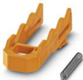
Component housing, length: 33 mm, Lock and Release system, color: orange, width: 16.2 mm

Please be informed that the data shown in this PDF Document is generated from our Online Catalog. Please find the complete data in the user's documentation. Our General Terms of Use for Downloads are valid ( http://phoenixcontact.com/download )