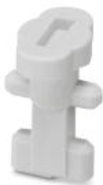
Locking element for locking the PCB onto UM-BASIC/PRO housing at level 3

Please be informed that the data shown in this PDF Document is generated from our Online Catalog. Please find the complete data in the user's documentation. Our General Terms of Use for Downloads are valid ( http://phoenixcontact.com/download )