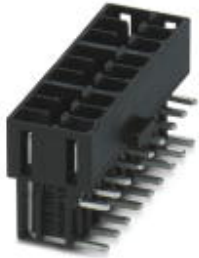
HSC header, touch-proof, 3 units, 18 connections, please note the positioning, color: black

Please be informed that the data shown in this PDF Document is generated from our Online Catalog. Please find the complete data in the user's documentation. Our General Terms of Use for Downloads are valid ( http://phoenixcontact.com/download )