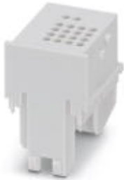
Component housing, length: 111.9 mm, Cover, color: light gray, width: 20.94 mm, height: 16.3 mm

Please be informed that the data shown in this PDF Document is generated from our Online Catalog. Please find the complete data in the user's documentation. Our General Terms of Use for Downloads are valid ( http://phoenixcontact.com/download )