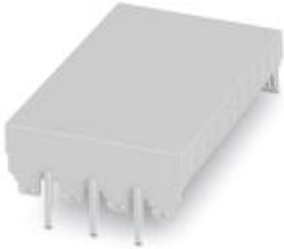
Component housing, length: 120.6 mm, Cover, color: light gray, width: 75.9 mm, height: 57.7 mm

Please be informed that the data shown in this PDF Document is generated from our Online Catalog. Please find the complete data in the user's documentation. Our General Terms of Use for Downloads are valid ( http://phoenixcontact.com/download )