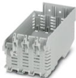
Component housing, length: 120.6 mm, Lower part, color: light gray, width: 75.9 mm, height: 57.7 mm

Please be informed that the data shown in this PDF Document is generated from our Online Catalog. Please find the complete data in the user's documentation. Our General Terms of Use for Downloads are valid ( http://phoenixcontact.com/download )