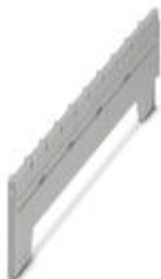
Component housing, length: 111.9 mm, Partition, color: light gray, width: 2.69 mm, height: 28 mm

Please be informed that the data shown in this PDF Document is generated from our Online Catalog. Please find the complete data in the user's documentation. Our General Terms of Use for Downloads are valid ( http://phoenixcontact.com/download )