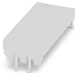
Component housing, length: 109.8 mm, Cover, color: light gray, width: 56.88 mm, height: 12.2 mm

Please be informed that the data shown in this PDF Document is generated from our Online Catalog. Please find the complete data in the user's documentation. Our General Terms of Use for Downloads are valid ( http://phoenixcontact.com/download )