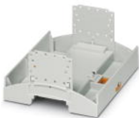
Installation component housing, length: 89.7 mm, color: light gray

Please be informed that the data shown in this PDF Document is generated from our Online Catalog. Please find the complete data in the user's documentation. Our General Terms of Use for Downloads are valid ( http://phoenixcontact.com/download )