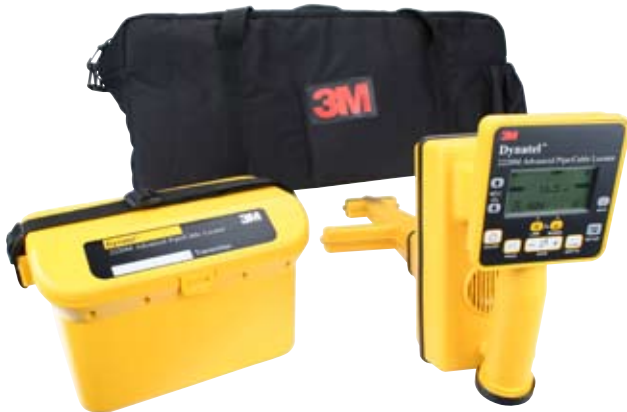
3M™ Dynatel™ Advanced Pipe/Cable Locator 2220M

When you choose a quality 3M Dynatel locator, you get outstanding performance and reliability, along with a 24/7 technical support and a service center dedicated to excellence. Our service center provides calibration, repair, upgrades and modifications for safety, performance and reliability.