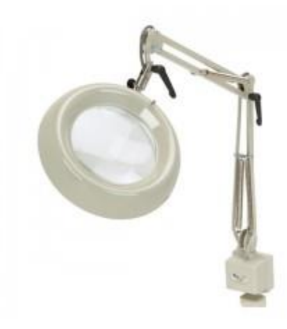
Big Eye™ 7.5" Round Magnifier - 43" Reach - Screw Down Base