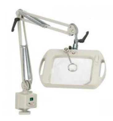
Vision-Lite® Rectangular Magnifier - 43" Reach - Table Edge Clamp