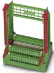
Plug-in card block, Nominal current: 4 A, Number of positions: 64, Pitch: 0 mm, Connection method: Screw connection

Please be informed that the data shown in this PDF Document is generated from our Online Catalog. Please find the complete data in the user's documentation. Our General Terms of Use for Downloads are valid ( http://download.phoenixcontact.com )