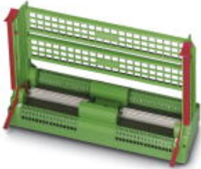
Plug-in card block, Pitch: 0 mm, Connection method: Screw connection, Contact surface: Tin

Please be informed that the data shown in this PDF Document is generated from our Online Catalog. Please find the complete data in the user's documentation. Our General Terms of Use for Downloads are valid ( http://phoenixcontact.com/download )