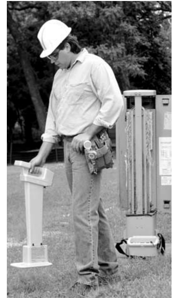
The 3M™ Dynatel™ Advanced Cable/Fault Locator 2273 can be used with the 3M™ Dynatel Marker Locating Accessory 2205/2206 EMS.

For cable path locating, the 2273 advanced cable/fault locator receiver uses one of four user-selected locating modes – dual peak, dual null, differential or special peak (which increases the sensitivity of the receiver for tracing over longer distances). The mode is selected depending on which is most effective under the locating conditions.