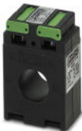
Bus-bar current transformer, 50 A AC primary current; 5 A AC secondary current; accuracy class 1; 1.25 VA rated power

Please be informed that the data shown in this PDF Document is generated from our Online Catalog. Please find the complete data in the user's documentation. Our General Terms of Use for Downloads are valid ( http://phoenixcontact.com/download )