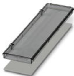
Installation component housing, Housing cover, Cross connection: Component housing, color: transparent, width: 161.6 mm

Please be informed that the data shown in this PDF Document is generated from our Online Catalog. Please find the complete data in the user's documentation. Our General Terms of Use for Downloads are valid ( http://phoenixcontact.com/download )