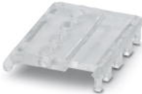
Ejector for COMBICON plug

Please be informed that the data shown in this PDF Document is generated from our Online Catalog. Please find the complete data in the user's documentation. Our General Terms of Use for Downloads are valid ( http://phoenixcontact.com/download )