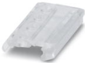
Ejector for COMBICON plug

Please be informed that the data shown in this PDF Document is generated from our Online Catalog. Please find the complete data in the user's documentation. Our General Terms of Use for Downloads are valid ( http://phoenixcontact.com/download )