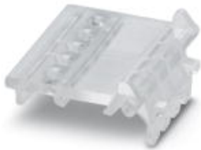
Ejector for COMBICON plug

Please be informed that the data shown in this PDF Document is generated from our Online Catalog. Please find the complete data in the user's documentation. Our General Terms of Use for Downloads are valid ( http://phoenixcontact.com/download )