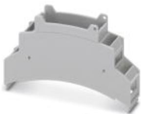
Installation component housing, length: 87.7 mm, Upper part, color: light gray, width: 17.8 mm, height: 62.2 mm

Please be informed that the data shown in this PDF Document is generated from our Online Catalog. Please find the complete data in the user's documentation. Our General Terms of Use for Downloads are valid ( http://phoenixcontact.com/download )