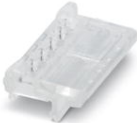
Ejector for COMBICON plug

Please be informed that the data shown in this PDF Document is generated from our Online Catalog. Please find the complete data in the user's documentation. Our General Terms of Use for Downloads are valid ( http://phoenixcontact.com/download )