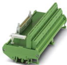
VARIOFACE interface module, for 32 channels, each with an additional terminal block per signal for a common plus potential

Please be informed that the data shown in this PDF Document is generated from our Online Catalog. Please find the complete data in the user's documentation. Our General Terms of Use for Downloads are valid ( http://phoenixcontact.com/download )