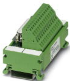
VARIOFACE module, with spring-cage connection and D-Subminiature socket strip, for mounting on NS 35/7.5, 25-pos.

Please be informed that the data shown in this PDF Document is generated from our Online Catalog. Please find the complete data in the user's documentation. Our General Terms of Use for Downloads are valid ( http://phoenixcontact.com/download )