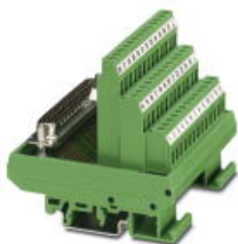
VARIOFACE module, with screw connection and D-Subminiature pin strip, for mounting on NS 35/7.5 or NS 32, 25-pos.

Please be informed that the data shown in this PDF Document is generated from our Online Catalog. Please find the complete data in the user's documentation. Our General Terms of Use for Downloads are valid ( http://phoenixcontact.com/download )