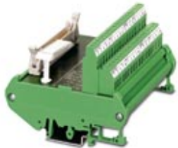
VARIOFACE I/O module, 32 channels for Siemens SIMATIC® S5-95U and S5-100U

Please be informed that the data shown in this PDF Document is generated from our Online Catalog. Please find the complete data in the user's documentation. Our General Terms of Use for Downloads are valid ( http://phoenixcontact.com/download )