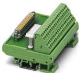
Standard 1:1 D-SUB module, with spring-cage connection and D-SUB pin strip, no. of positions 9

Please be informed that the data shown in this PDF Document is generated from our Online Catalog. Please find the complete data in the user's documentation. Our General Terms of Use for Downloads are valid ( http://phoenixcontact.com/download )