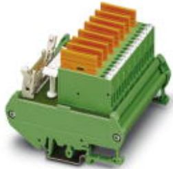
Fuse module with LEDs (for digital input cards of the Delta V control system)

Please be informed that the data shown in this PDF Document is generated from our Online Catalog. Please find the complete data in the user's documentation. Our General Terms of Use for Downloads are valid ( http://phoenixcontact.com/download )