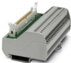
VARIOFACE interface module for Siemens SIMATIC® S7-300, with SIMATIC®-specific labeling (1 - 40), with screw connection, module width: 106.1 mm

Please be informed that the data shown in this PDF Document is generated from our Online Catalog. Please find the complete data in the user's documentation. Our General Terms of Use for Downloads are valid ( http://phoenixcontact.com/download )