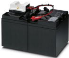
Energy storage device, lead AGM, VRLA technology, 24 V DC, 38 Ah, automatic detection, and communication with QUINT UPS-IQ

Please be informed that the data shown in this PDF Document is generated from our Online Catalog. Please find the complete data in the user's documentation. Our General Terms of Use for Downloads are valid ( http://phoenixcontact.com/download )