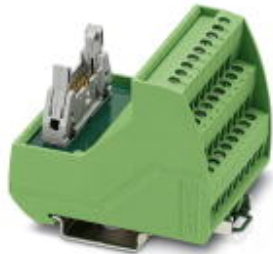
VARIOFACE sensor module, for connecting 8 pnp sensors, with LED

Please be informed that the data shown in this PDF Document is generated from our Online Catalog. Please find the complete data in the user's documentation. Our General Terms of Use for Downloads are valid ( http://phoenixcontact.com/download )