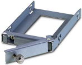
2.5" SATA tray kit for Basicline 3000 and 7000 industrial PC

Please be informed that the data shown in this PDF Document is generated from our Online Catalog. Please find the complete data in the user's documentation. Our General Terms of Use for Downloads are valid ( http://phoenixcontact.com/download )