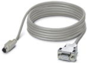
Connecting cable, for connecting the controller to a PC (RS-232) for PC WORX with flow control, 3 m in length

Please be informed that the data shown in this PDF Document is generated from our Online Catalog. Please find the complete data in the user's documentation. Our General Terms of Use for Downloads are valid ( http://phoenixcontact.com/download )