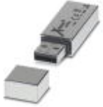
USB memory stick, 8 GB

USB memory stick - USB FLASH DRIVE - 2402809