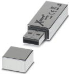
USB memory stick, 8 GB

Please be informed that the data shown in this PDF Document is generated from our Online Catalog. Please find the complete data in the user's documentation. Our General Terms of Use for Downloads are valid ( http://phoenixcontact.com/download )