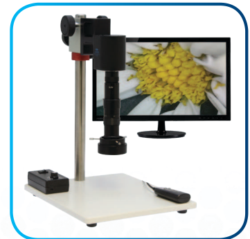
Mighty Mag Micro 26700-109