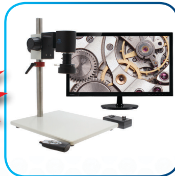
Mighty Mag Macro 26700-108