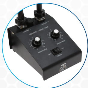
Light Adjustment Knobs for Each Illuminator and On/Off Switch on Metal Base