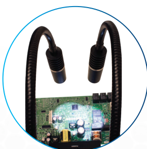
Illuminate and Overlap Spotlights at Any Angle