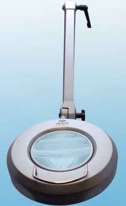
5 Inch/ 5 Diopter Lens 2.25x Magnification