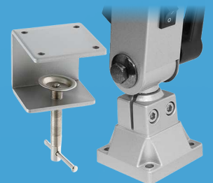
Heavy-Duty Mounting Clamp

The innovative ProVue Deluxe LED Magnifying lamp from Aven is the new standard in inspection lighting. This durable aluminum design features a 5 inch, 5 diopter glass lens for crystal clear, distortion-free viewing. Featuring 72 energy-efficient LED lights for shadow-free illumination.