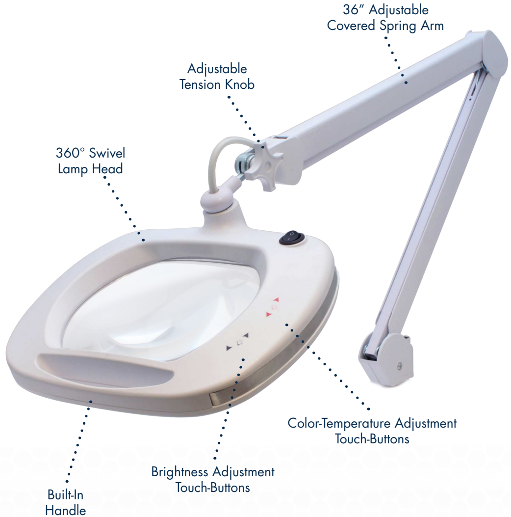
36" Adjustable Covered Spring Arm