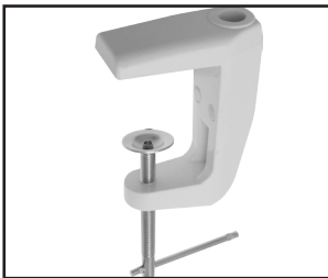
Heavy-Duty Mounting Clamp