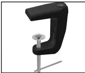
Heavy-Duty Mounting Clamp