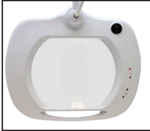
7.5 Inch x 6.2 inch/ 3 Diopter Lens 1.75x Magnification