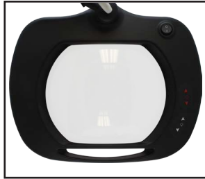
7.5 Inch x 6.2 inch / 5 Diopter Lens 2.25x Magnification