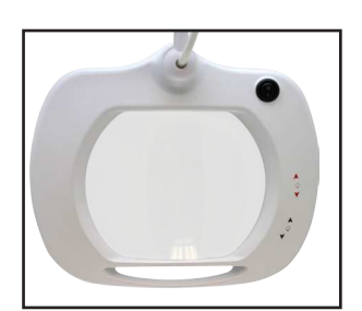
7.5 Inch x 6.2 inch/ 3 Diopter Lens 1.75x Magnification