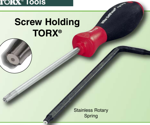
Stainless Rotary Spring