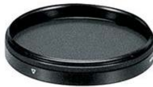
Protective Lens Cover Product # 26800B-465