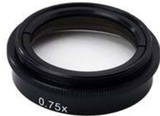
Auxiliary Lens 0.75x Product # 26800B-462