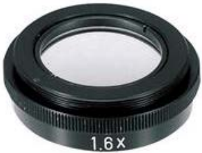
Auxiliary Lens 1.6x Product # 26800B-463