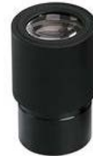
DSW-10X - DSZ-44 and NSW series bodies Product # 26800B-441