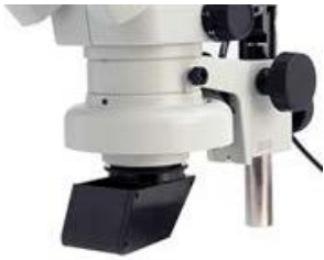
Oblique Viewer Product # 26800B-485