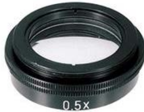
Auxiliary Lens 0.5x Product # 26800B-461