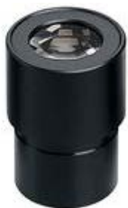
DSW-15X - DSZ and NSW series bodies