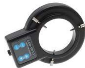
Ring Light LED Triple Color