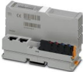
Axioline bus coupler for PROFINET (including bus base module and connector)

Please be informed that the data shown in this PDF Document is generated from our Online Catalog. Please find the complete data in the user's documentation. Our General Terms of Use for Downloads are valid ( http://phoenixcontact.com/download )