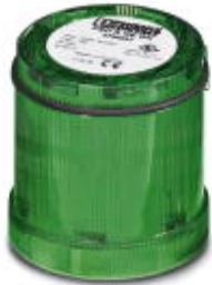
Permanent light element, 12 to 240 V AC/DC, green, without bulb

Please be informed that the data shown in this PDF Document is generated from our Online Catalog. Please find the complete data in the user's documentation. Our General Terms of Use for Downloads are valid ( http://phoenixcontact.com/download )