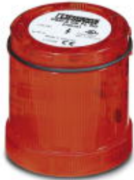
Flashing beacon element, 24 V DC, red, Xenon flash tube

Please be informed that the data shown in this PDF Document is generated from our Online Catalog. Please find the complete data in the user's documentation. Our General Terms of Use for Downloads are valid ( http://phoenixcontact.com/download )