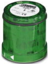
Flashing beacon element, 24 V DC, green, Xenon flash tube

Please be informed that the data shown in this PDF Document is generated from our Online Catalog. Please find the complete data in the user's documentation. Our General Terms of Use for Downloads are valid ( http://phoenixcontact.com/download )